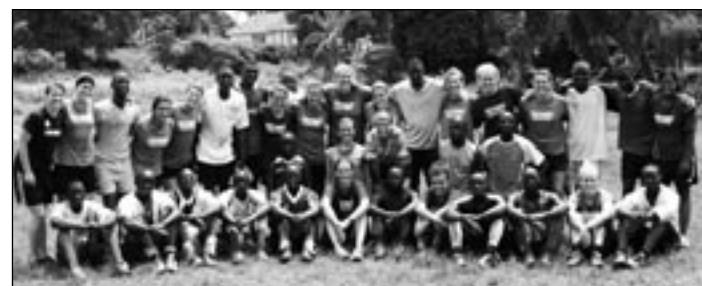
The Westmont Women's Soccer team trained with the Good News team from the Sports Outreach Institute in Kampala, Uganda