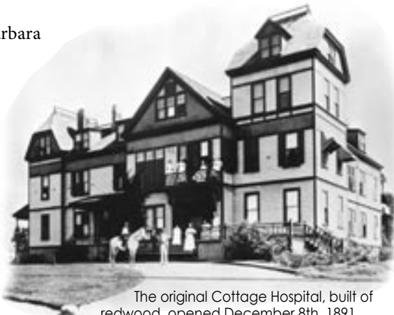
The original Cottage Hospital, built of redwood, opened December 8th, 1891.