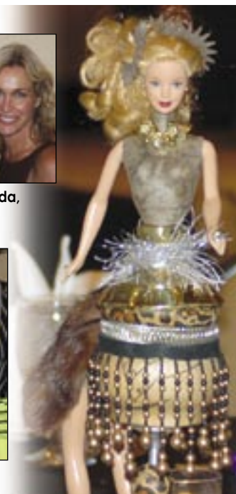
Barbie by Ellen Orlando

See more Photos by Priscilla at santabarbaraseen.com Contact her at priscilla@santabarbaraseen.com • (805) 969-3301