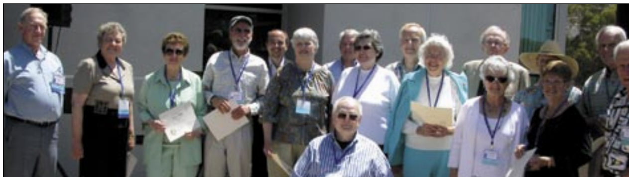
Alumni from the Class of 1958 gather to celebrate their 50-year reunion

For more information about alumni events visit www.ucsbalum.com