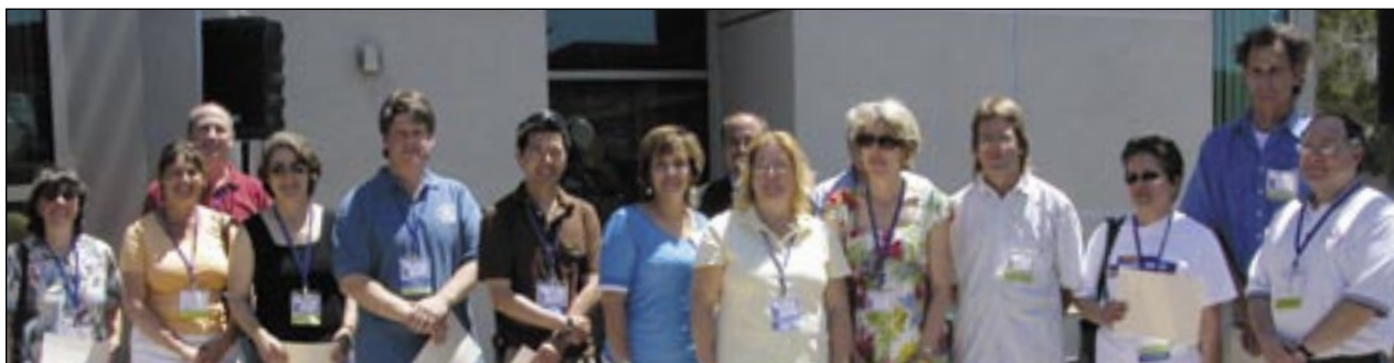
Alumni from the Class of 1983 celebrate their 25-year reunion