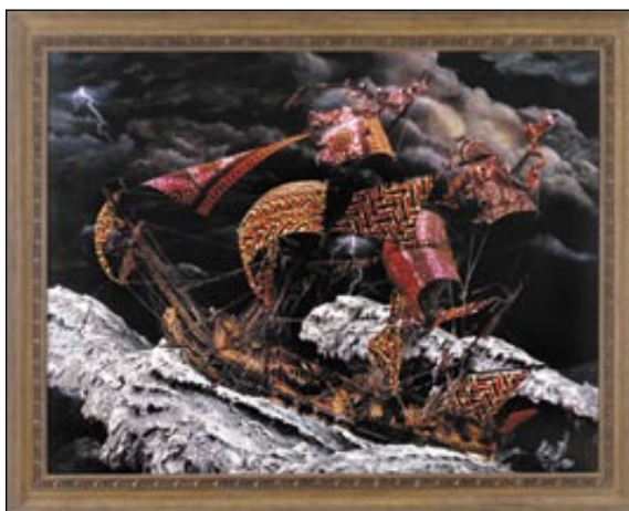
La Meduse C Print by Yinka Shonibare MBE