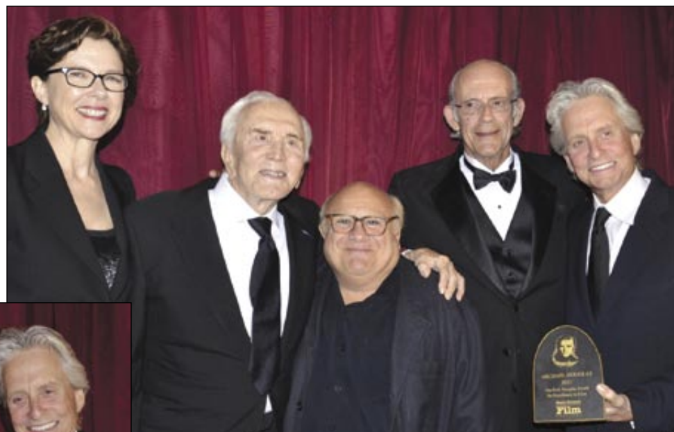
Annette Bening, Kirk Douglas, Danny DeVito, Christopher Lloyd, and Michael Douglas

On the podium Annette Bening reminisced about how easy it was to work with Douglas. She co-starred with him in The American President and called the event “a wonderful night.” Actor/Director Danny DeVito discussed their friendship over the years, after having met the young Douglas backstage in 1964 in a summer theatre setting. He added that Michael “is deserving of