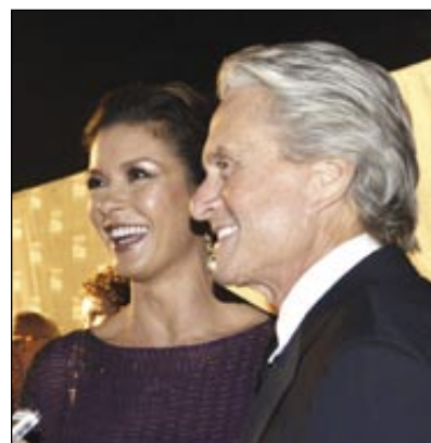
Catherine Zeta-Jones with her husband honoree Michael Douglas