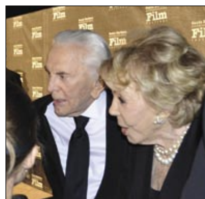
Kirk and Anne Douglas