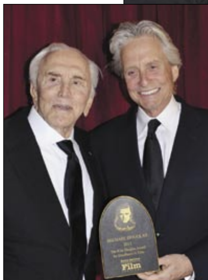
Kirk Douglas and Michael Douglas