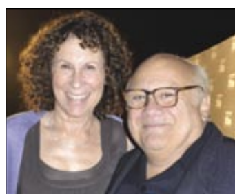
Rhea Perlman and Danny DeVito