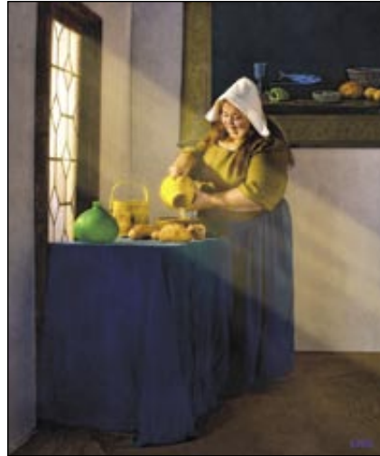
The Day Begins by Charlie Mitchell

The gallery, located at the far end of the camera store, is a single spacious room. Mitchell's framed images cover the